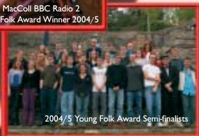
2004/5 Young Folk Award Semi-finalists